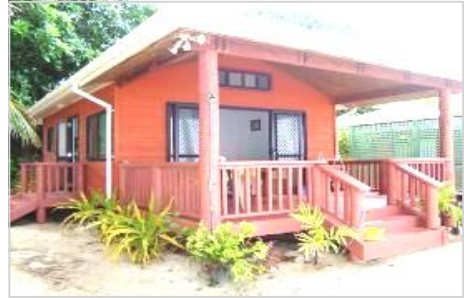
You Bungalows awaits...