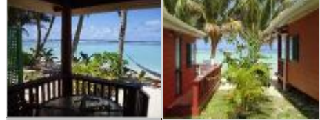
Enjoy the view...