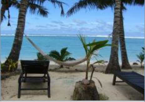
Right on the waters edge