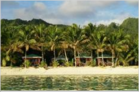
Bella Beach Bungalows

A good choice for couples, single travellers or friends travelling together.