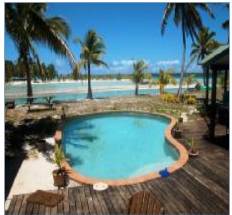
Enjoy a dip in the pool & the lagoon view