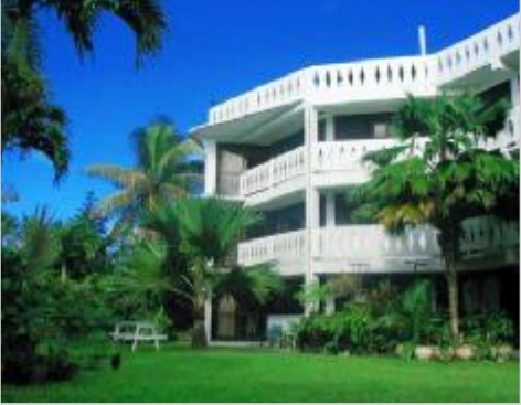
Your Beach House awaits you...

This property offers 4 spacious apartments with seaview balconies or garden surrounds. Each unit is fully self contained with cooking facilities, dining + lounge area, bathroom, cooling fans and ceramic tiles throughout. Ideal for the "independent" holiday maker.