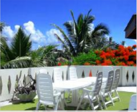
A room with a view