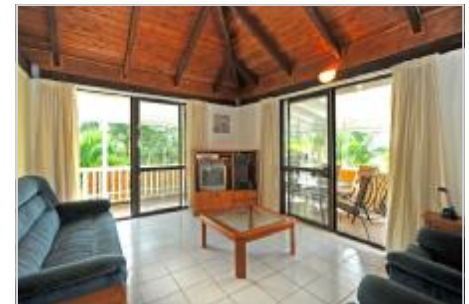
Lagoon View 2 Bedroom Villa Interior