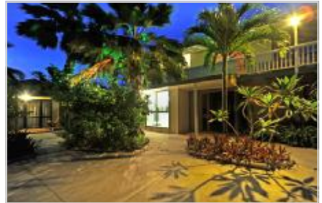
Cooks Oasis Entrance

This property is a quiet haven for peace and relaxation for couples, this property also welcomes children so is a great choice for families, and also well suited to groups travelling together including wedding parties.