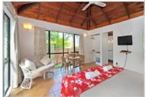
Garden Villa Interior