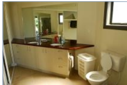
LOWER FLOOR BATHROOM