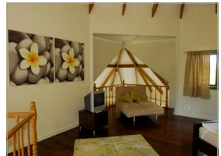
TOP FLOOR LOUNGE AREA