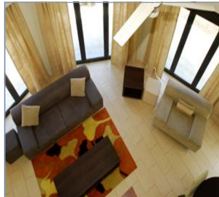
LOUNGE ROOM VIEW FROM UPSTAIRS BEDROOM