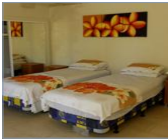
DOWNSTAIRS BEDROOM TWIN CONFIGURATION