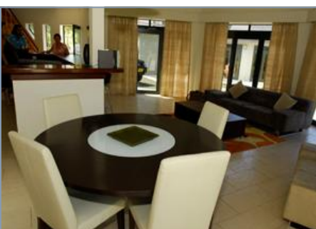
MODERN FURNITURE COMPLIMENT THE OPEN STYLE OF THE VILLAS