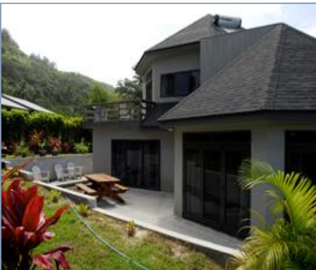
THE OUTSIDE PATIO EXTENDING FROM THE OPEN PLAN LIVING AREA