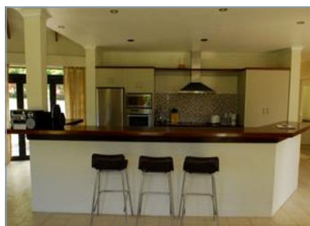
THE OPEN PLAN KITCHEN ENSURE THAT THE COOK WON'T MISS OUT ON ANYTHING