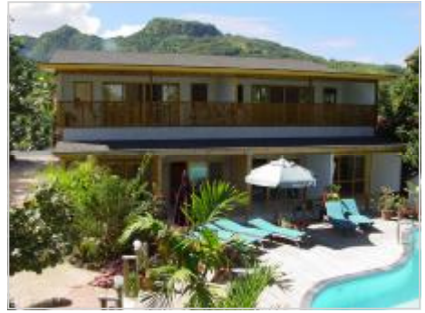
Your Villa awaits you...

The property is centrally located in the village of Arorangi. Restaurants, Grocery Stores and small retail outlets are all within walking