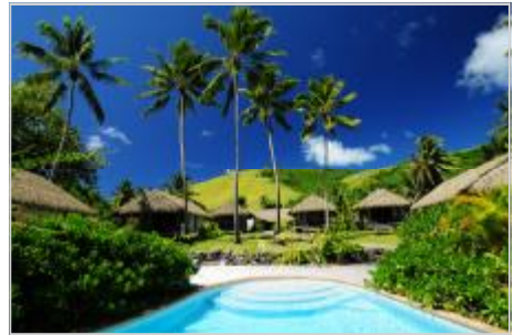
Your Bungalow awaits you...

Tamanu Beach is a family operated property and offers guests a wonderful experience combining a blend of culture, tradition, superb beach location and some friendly local Cook Island hospitality.