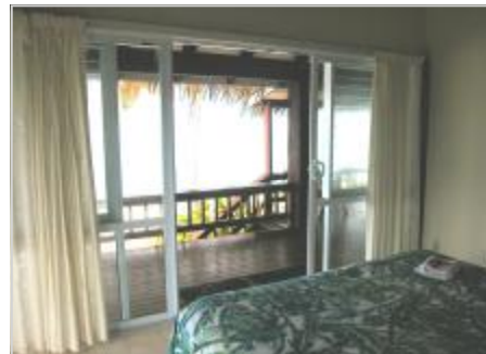
Bedroom Beach View