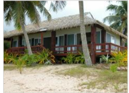
Your Villa Awaits you..

Property has wheelchair access and is serviced once a week.