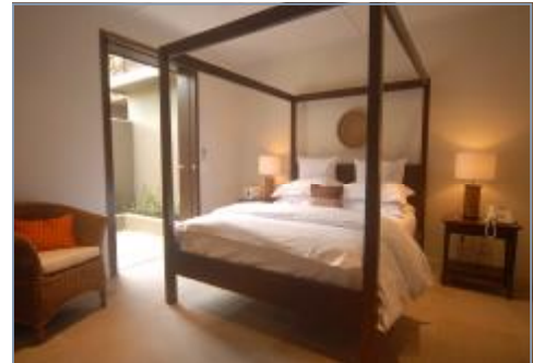
ONE BEDROOM VILLA - BEDROOM