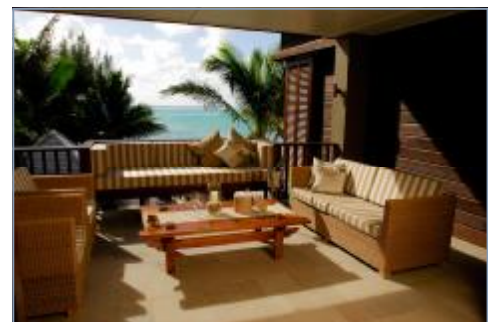
TWO BEDROOM VILLA - BALCONY