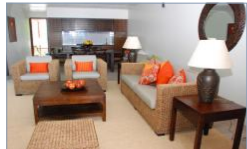
TWO BEDROOM VILLA - LOUNGE