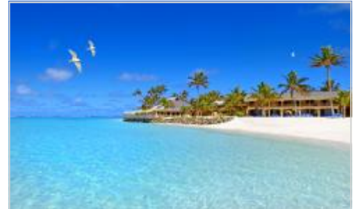
Sanctuary Rarotonga ....

Complimentary Daily Tropical Breakfast, Welcome Fruit Juice on Arrival, Free use of Kayaks