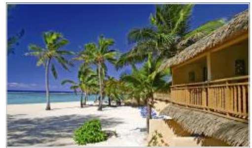
Absolute Beachfront Location....