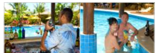
Enjoy A Refreshing Drink In The Swim Up Pool Bar....