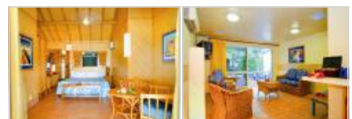
Your Beachfront Suite Awaits....