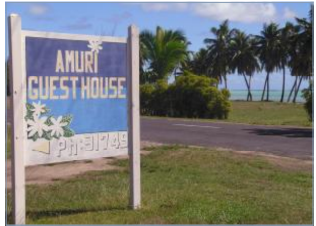
A short walk to the main road.

It is 50 metres to the white sand and a 5 minute walk to fine snorkelling area. All children are welcome at this property.