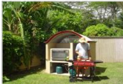
BBQ and Outdoor Cooking Area