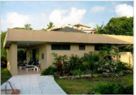
Your Villa awaits you...

A well appointed property set in lovely tropical garden settings with superb views to sit back in the evening and enjoy the beautiful Rarotonga sunsets.