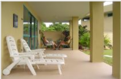
Relax on the Verandah....